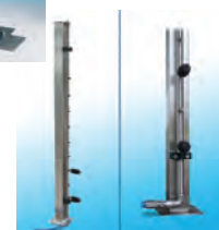
High Pressure Tower