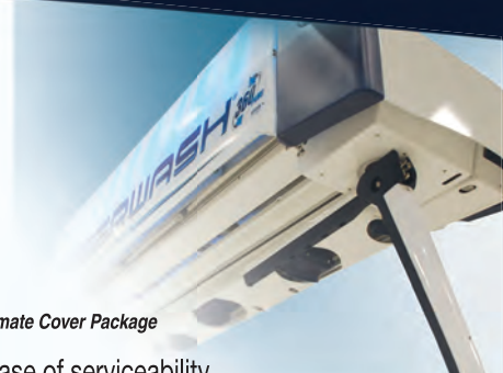
Ultimate Cover Package

The LaserWash® 360 Plus Ultimate cover package is both attractive and functional. The standard ultimate cover package offers a complete state-of-the-art look that is sure to impress your customers. In addition to its looks, the cover package reduces machine exposure to the harsh wash bay environment. Underneath the covers, a separate enclosure for air valves has been added to the bridge, while all fluid valves have been removed, increasing overall reliability and serviceability.