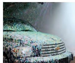
3X Color Foam System

PDQ's exclusive Front Bug Prep can increase your revenue without adding time to the wash process. Your customers will love this feature, which focuses on the windshield, back sides of the mirrors, and the front of vehicles. Attack those hard-to-clean areas with PDQ's Front Bug Prep.