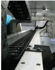
E-Chain Left or right mounted energy chain for easy and low-cost installation