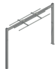
Triple Rain Arch Mount