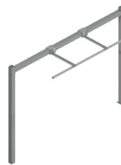
Single Rain Arch Mount