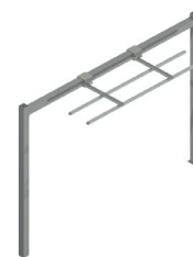
Double Rain Arch Mount