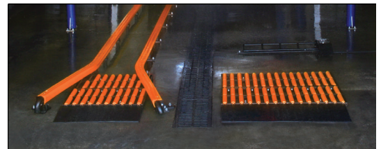
*Shown w/above ground correlator and optional DXD Y-Section