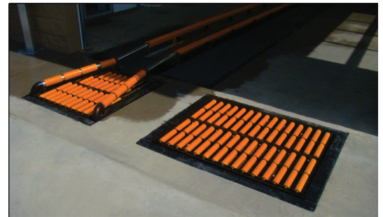
*Shown w/standard inground correlator and optional Stainless Steel Y-Section

Passenger Side Length 3' 7" (w/ramp) Passenger Side Width 3' 5"