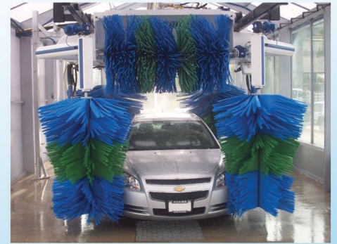
Powerful five-brush system cleans everything it touches, delivering up to 20 clean cars every hour