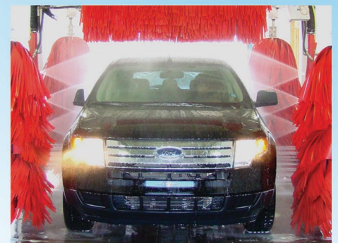
Available HydroBlade® with Wheel Stinger® adds high pressure and wheel cleaning upsell opportunities